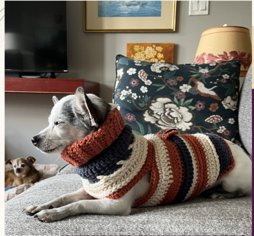
Charlotte: Doggy Diva

The Doggy Diva is emotionally sophisticated in a way that can genuinely surprise people. While they may appear unbothered, they are always aware of who and what is going on around them. Being so highly-sensitive to their surroundings, Doggy Divas naturally have preferences, which are made unmistakably known.