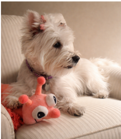
Fergie: OG Doggy Diva