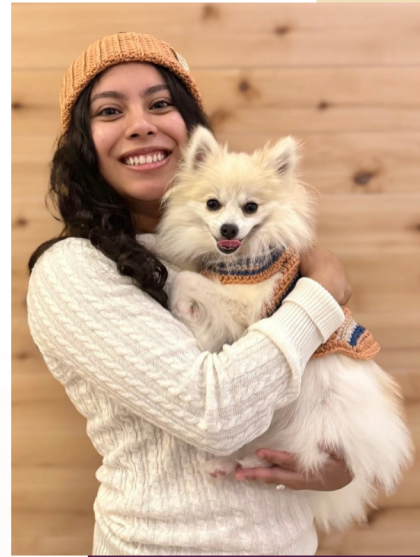
Baisy: Doggy Diva

Over time, the relationship with a Doggy Diva is the reward for repetition, patience, understanding, and acceptance of their diva behaviors.