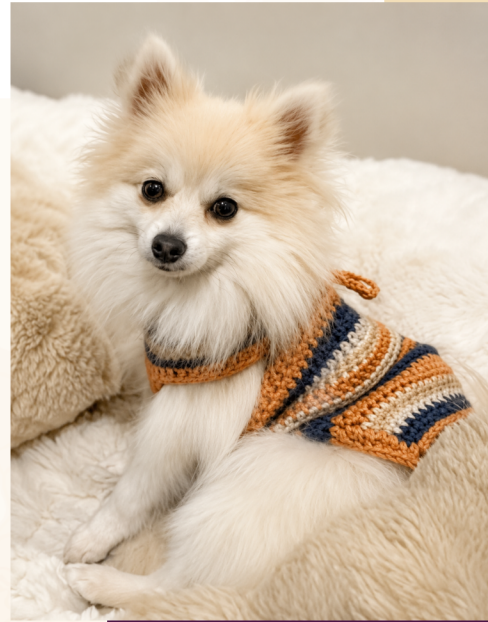
Baisy: Doggy Diva